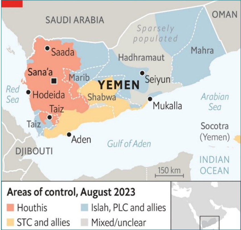
Source: The Economist. (2023, August 9). Can Yemen hold together? The Economist. https://www.economist.com/middle-east-and-africa/2023/08/09/can-yemen-hold-together

The UAE has significant regional security interests in southern Yemen, focused on safeguarding vital maritime routes, particularly the Bab el-Mandeb Strait, which is crucial for global trade.