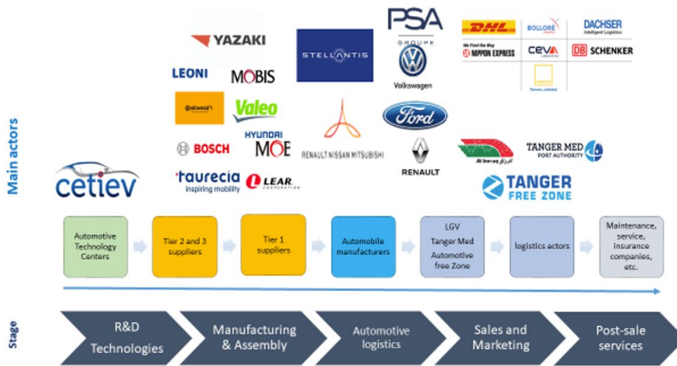
Automotive Value Chain in Morocco (non-exhaustive actors list)

The automotive value chain in Morocco is dominated by labor-intensive sub-sectors, such as seat wiring and manufacturing, on the one hand, and car assembly plants, on the other hand. In addition, a small number of companies produce spare parts, such as brake pads and filters. However, the rate of local value added is increasing. Proof of real integration in GVCs beyond a simple production base, R&D is rapidly evolving, which has materialized in the entire development of the Citroën AML electric car in Morocco, and the support for the launch of the common modular platform Stellantis CMP in Kenitra. The engine assembly began for the same project, and various parts, including lamps, steering, rims, and batteries, were integrated locally. In addition, a new model specific to Renault’s Tangier plant has been launched, which means full industrialization in Morocco, and more significant opportunities for suppliers established in the country.